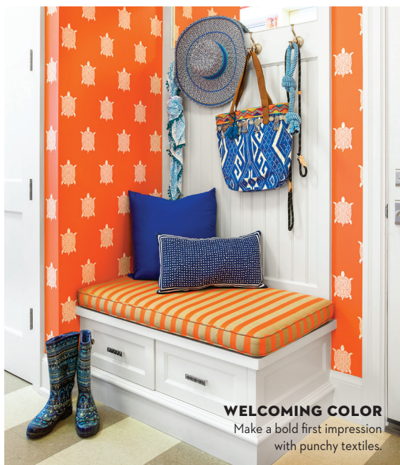
WELCOMING COLOR Make a bold first impression with punchy textiles.