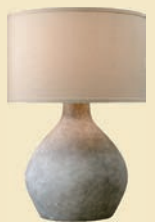
TEXTURED STONE LAMP $343