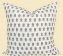
LULU FLORAL PILLOW $88

Many of the pieces in this space are from Hammel’s online shop, Brooke & Lou. Snag everything you see here at brookelandlou.com .