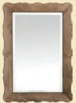
FAWN MIRROR $1,098