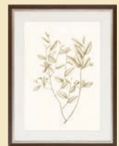
NATURAL FLORAL PRINT $298